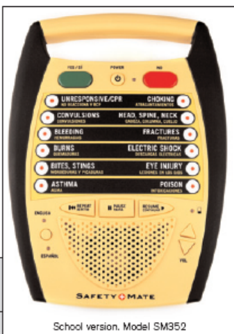
School version, Model SM352

Imagine a life-threatening emergency has just taken place. You know to call 9-1-1, but did you know the system receives 183 million calls a year and is being inundated with non-emergency calls that are tying up operators? And once you get through to an operator, what do you do while you wait an average of 10 minutes for emergency medical services to arrive? How you respond and use the precious minutes before professional help arrives could make the difference between life and death. It's time to grab your SafetyMate.