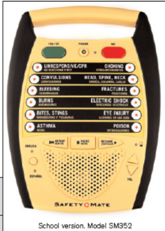
School version, Model SM352

Imagine a life-threatening emergency has just taken place. You know to call 9-1-1, but did you know the system receives 183 million calls a year and is being inundated with non-emergency calls that are tying up operators? And once you get through to an operator, what do you do while you wait an average of 10 minutes for emergency medical services to arrive? How you respond and use the precious minutes before professional help arrives could make the difference between life and death. It's time to grab your SafetyMate.